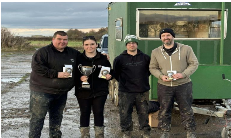
Team OFG Winners of the Malachi Team Trophy

Planning is well underway for the Nationals at Stainby3 Clubs of Lincs, P&D and Leicestershire and Rutland are working behind the scenes to make sure we have a successful National Rally. Lincs is running the Comp Safari, so it would be good to get as many members there not only for the comp, but to help in any way over the weekend. If any members have any ideas for trade stands, food stands or sponsorship get in contact with myself. Every increasing costs on things like toilets, showers and waste disposal are hindering costs, if anyone knows of local business that can help, it would be much appreciated, as the costs of these will be getting passed down into the entry price unfortunately. Bookings are now live – so what are you waiting for, get booked in.